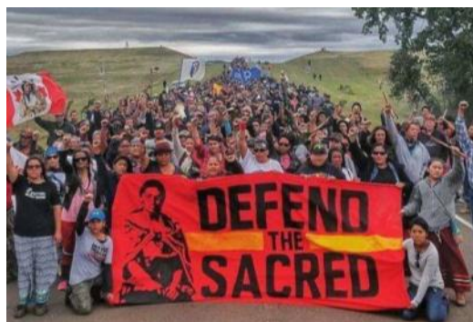
“A pivotal point”: activists at Standing Rock marched in the fall.

solidarity, and to honor and uplift their traditional ceremonies, cultures and leadership.