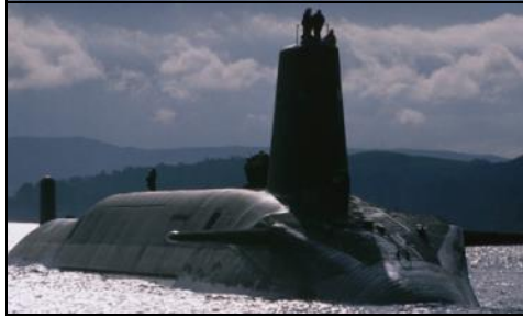
Humanity's deadliest creation is now even more lethal.

Trident is now three times more deadly than ever before. The US is rapidly moving toward production of a new ballistic missile submarine fleet that will be even more sophisticated than its predecessor. The twelve submarines of the Columbia Class (that will replace the OHIO Class) are being built to sail well into the end of this century. Along with the new submarines, the Navy is already seeking a new missile to replace the Trident II D5.