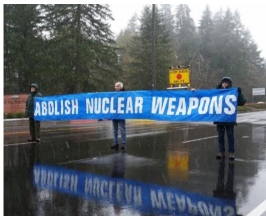
Neither rain, nor sleet, nor snow can stop the determined PLC members from standing for a peaceful world.