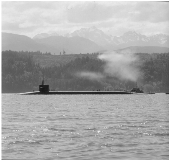
Prowling the peaceful waters: A Trident sub surfaces in Hood Canal.

I recall a scene from a documentary film made in the 1980s about the Tracks Campaign, in which Ground Zero members sat on the train tracks leading to the Bangor base, blocking the trains that carried nuclear warheads and missile motors onto the base. In this scene, a man is talking about his experience sitting on the tracks, watching the train creep toward him. In that train, and its cargo of hydrogen bombs, he saw the power to destroy the world. And then he saw that power coming toward him, closer and closer, casting a shadow to darken the world. And then, just as it got to him, the train