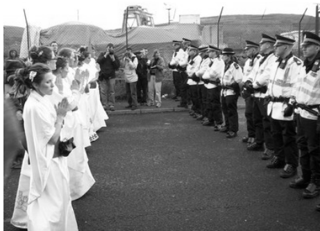
Heavenly intervention? Women dressed as angels face arrest at a 2005 Faslane action.

According to organizers, the purposes of the campaign are "to bring people to witness and impede the nuclear base where Britain's nuclear weapons are deployed, and enable them to demonstrate the range of serious concerns - from human rights to climate change - that people in the real world consider to be the vital challenges for the 21st century."