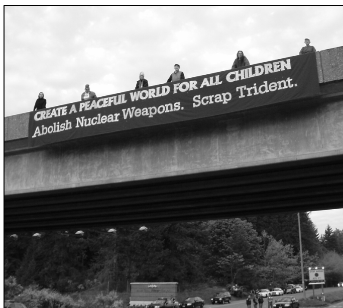
No missing the message: activists held a banner over Luoto Road before, during, and after the action.

apart. A female Marine felt my arms, legs, crotch, buttocks, breasts, neck. And then the cuffs, double-locked for my safety, they said.