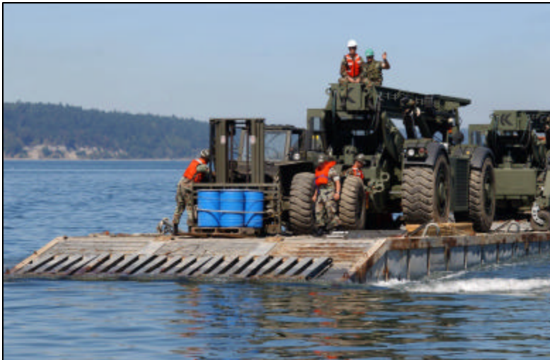
Accountable to no one? The Navy Seabee Amphibious Construction Battalion One moves vehicles to a pier at Indian Island, during a training exercise in 2005. a .

The National Environmental Policy Act (NEPA) and the Freedom of Information Act (FOIA) were enacted with the expressed purpose of public disclosure. Both laws are based upon the principle that an informed citizenry is essential for a democratic society.