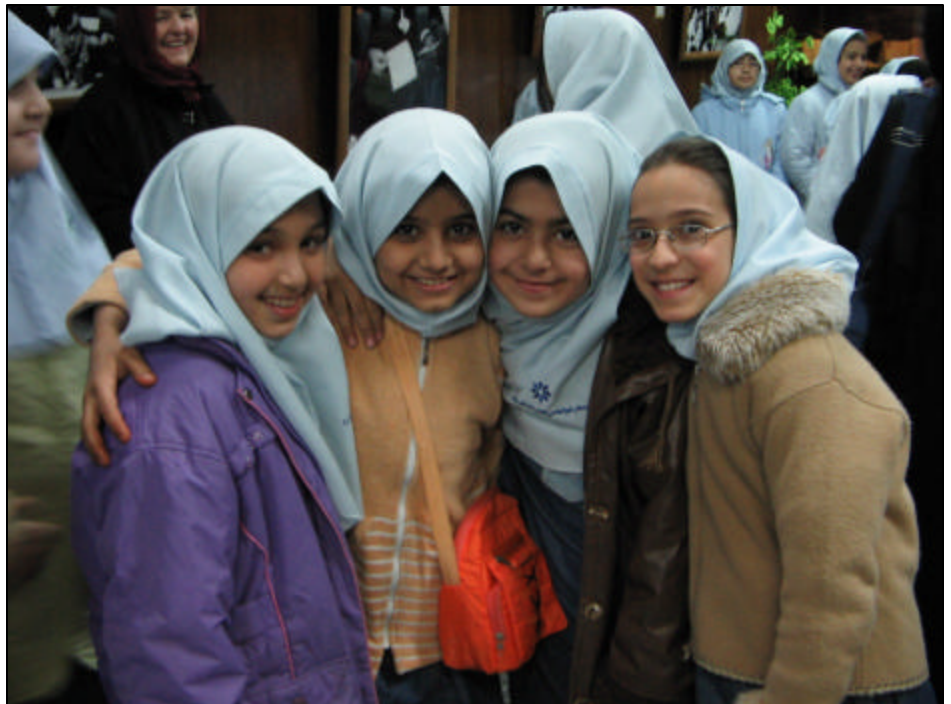
"Mr. Cheney, we are not your enemy." Girls in Iran pose for a picture taken by a member of a US delegation.

weapons, and take up Russian President Vladimir Putin's offer of several years ago to cut our mutual nuclear arsenals of about 10,000 weapons to 1,000. Once the US and Russia get down to reasonable numbers approaching the arsenals of the other nuclear weapons states – China, UK, France and Israel, who